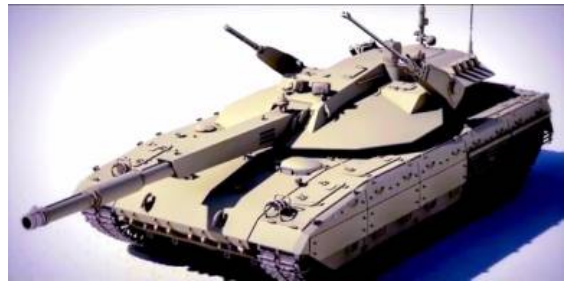
Fig 2: Putin's New WundeWaffe

With increased firepower and protection, these mechanized forces would, only some 20 years later, become the armor of World War II. When self-propelled artillery, the armored personnel carrier, the wheeled cargo vehicle, and supporting aviation - all with adequate communications - were combined to constitute the modern armored division, commanders regained the capability of maneuvre.