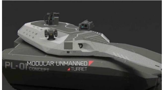
Fig 3: Obrum Advanced Stealth

War tanks are also termed to be known as main battle tanks (MBT), it fills up with armed protected fire munitions which will directly fire on the enemy. Tanks have been using since and before the World War-I as it is reliable to use during wars. Its hull is capable of defending the heavy attacks on it. Since then it is used by the man inside the tanks. As the time passes and technology in the world evolves the tanks are also been upgrading since the attack is also getting upgraded. But after a certain period of time manufacturing rate of tanks in certain countries decreases due to certain constraints in the tanks.