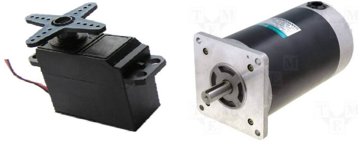
Fig 8: Servo Motor

Servo motors with four hand used here have operating voltage of (4.5-6) v DC and have an operating angle of 170<sup>0</sup> approx. This is work by pulse width modulation with a pulse rate of approx... 20ms.