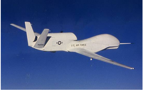
Fig 4: UAV

It is asystem which is operated automatically without being the presence of man. This system is often called as Unmanned System. Unmanned system isat the high rate of evolution in the air and space where it is found to be more and more effective and reliable.