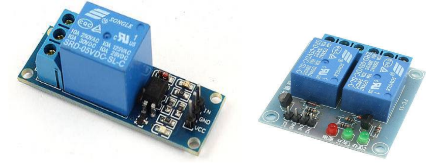
Fig 10: Single Channel Relay Fig 11: Double Channel Relay

Two kinds of relays are used. Single channelrelay shown in fig 10, works on the electromagnetic principle used for interfacing microcontroller with the output fields instruments. Double channel relay shown in fig 11 have the output voltage of 5v dc and used for a drive the motor in 2 directions.