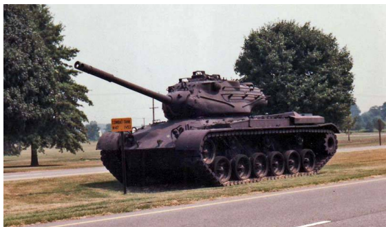
Fig 1: M47 Korean Tank

The tank history was begun during World War-I when armored all-terrain fighting vehicles were first deployed in the war as a response to the problems of trench warfare. Though the tank was unreliable and crude, tank eventually becomes the essential part of the war for ground armies. By World War II, and before the tank design had advanced significantly, and tanks were used in quantity in all land theaters of the war at any time. The Cold War saw the rise of modern tank doctrine and the general purpose main battle tank. The tank still provides the backbone to land combat operations in the 21st century.